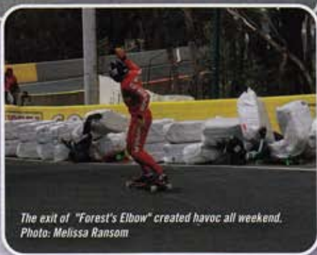
The exit of "Forest's Elbow" created havoc all weekend.